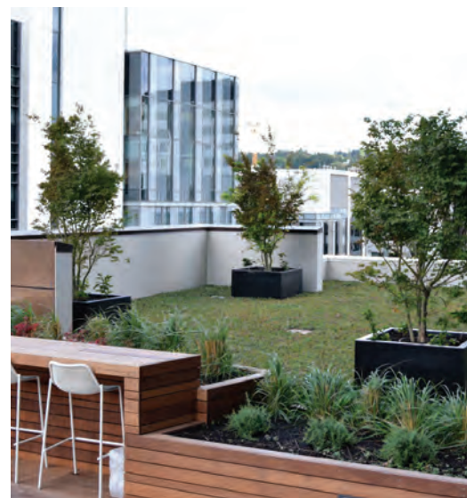
Planter Assemblies include our lightweight planter media.

LINK PLANTER • RECTANGULAR • SQUARE • CYLINDER • LINK EDGER