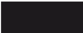
1. Matte Black

Color Options: Select one of our standard designer colors, or custom powder coated to RAL or sample.