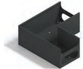
Right Angle Corner