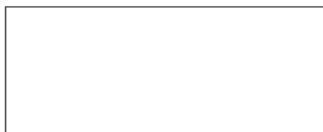
2. Gloss White