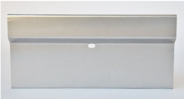
Tray Edger Elevation (Partial Segment)